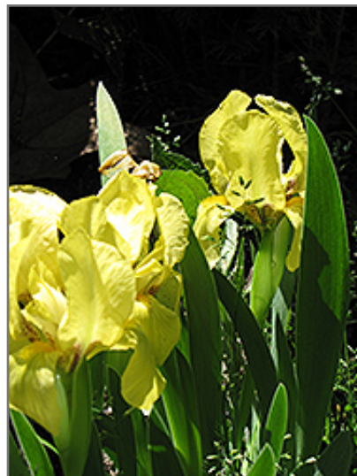
Churchill Downs Iris flowers