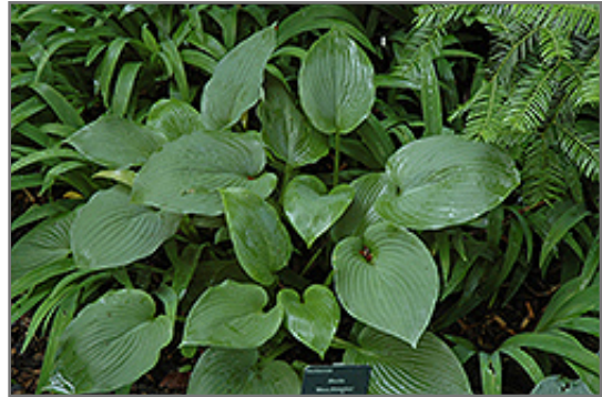
Blue Dimples Hosta foliage