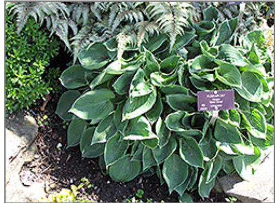
Dew Drop Hosta