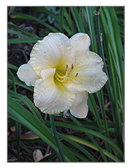
Wonders Never Cease Daylily flowers

Day lilies are commonly grown garden plants; these hardy perennials require practially no maintenance and have large and attractive blooms similar to lily flowers; all parts of the plant are edible although the flowers are the most frequently used