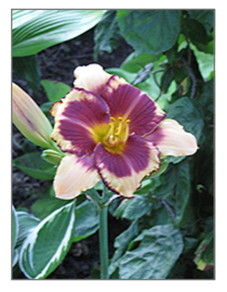
Tecus Daylily flowers

Day lilies are commonly grown garden plants; these hardy perennials require practially no maintenance and have large and attractive blooms similar to lily flowers; all parts of the plant are edible although the flowers are the most frequently used