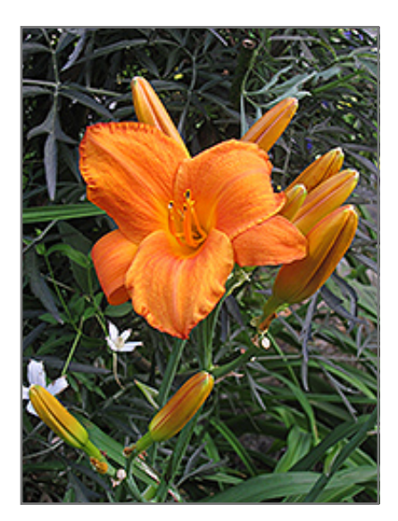
Techny Spider Daylily flowers

Day lilies are commonly grown garden plants; these hardy perennials require practially no maintenance and have large and attractive blooms similar to lily flowers; all parts of the plant are edible although the flowers are the most frequently used