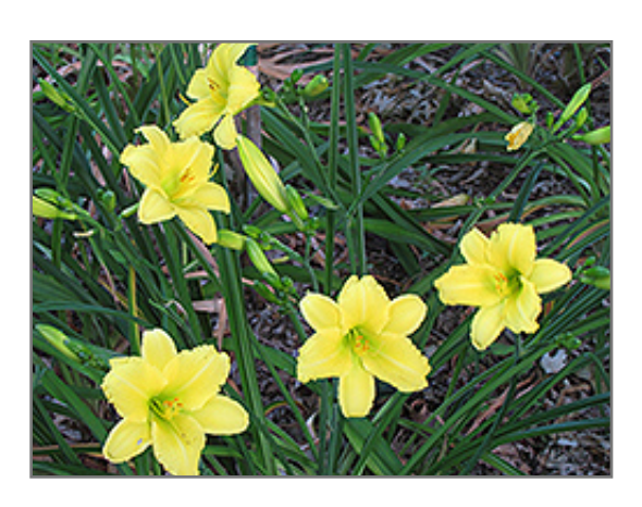
Green Flutter Daylily flowers

Day lilies are commonly grown garden plants; these hardy perennials require practially no maintenance and have large and attractive blooms similar to lily flowers; all parts of the plant are edible although the flowers are the most frequently used