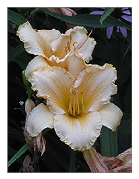
Femme Osage Daylily flowers

Day lilies are commonly grown garden plants; these hardy perennials require practially no maintenance and have large and attractive blooms similar to lily flowers; all parts of the plant are edible although the flowers are the most frequently used