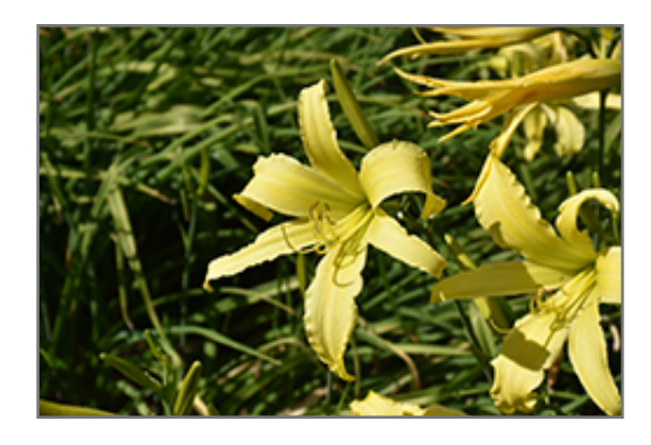
Easy Ned Daylily flowers