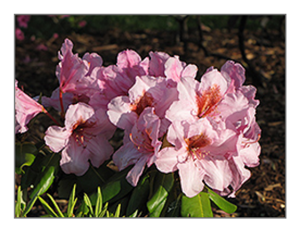
Vineland Rhododendron flowers

This lovely evergreen shrub is bathed in clusters of airy shell pink blooms with a dramatic copper blotch for contrast; an excellent choice to mass in groupings, or as a dramatic focal point of the garden; must have rich acidic soil