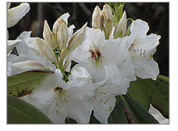
Avalanche Rhododendron flowers

Avalanche Rhododendron is covered in stunning clusters of lightly-scented white trumpet-shaped flowers with a burgundy blotch at the ends of the branches in mid spring, which emerge from distinctive creamy white flower buds. It has dark green evergreen foliage. The glossy narrow leaves remain dark green throughout the winter.