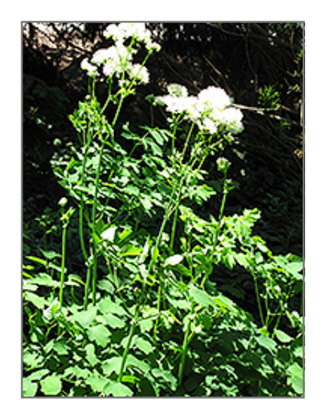
Sparkler Meadow Rue in bloom