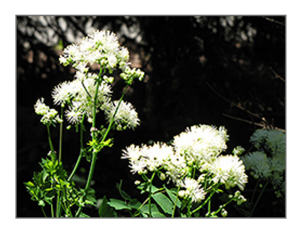
Sparkler Meadow Rue flowers

This is a relatively low maintenance plant, and should be cut back in late fall in preparation for winter. It is a good choice for attracting bees and butterflies to your yard, but is not particularly attractive to deer who tend to leave it alone in favor of tastier treats. It has no significant negative characteristics.