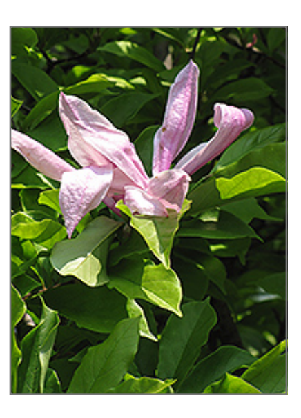
Pickard's Ruby Saucer Magnolia flowers

Pickard's Ruby Saucer Magnolia is smothered in stunning fragrant ruby-red cup-shaped flowers with pink overtones held atop the branches in early spring before the leaves. It has dark green foliage with grayish green undersides. The large glossy pointy leaves turn coppery-bronze in fall.