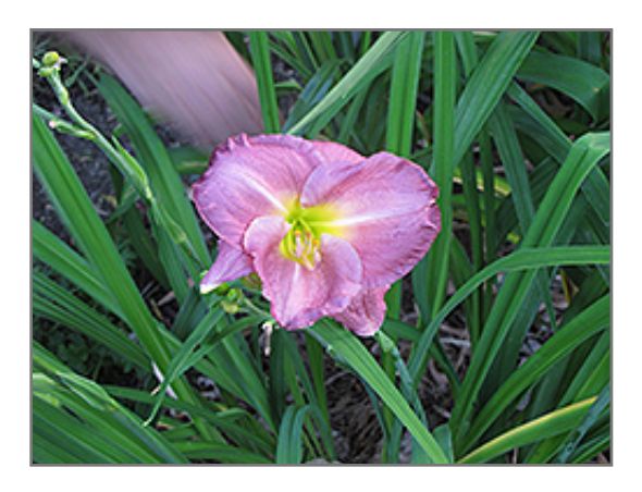
Court Magician Daylily flowers