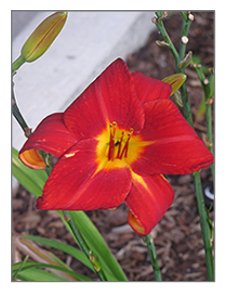
Autumn Red Daylily flowers

Day lilies are commonly grown garden plants; these hardy perennials require practially no maintenance and have large and attractive blooms similar to lily flowers; all parts of the plant are edible although the flowers are the most frequently used