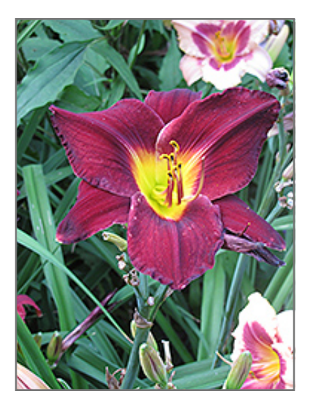
Alaskan Midnight Daylily flowers

Day lilies are commonly grown garden plants; these hardy perennials require practially no maintenance and have large and attractive blooms similar to lily flowers; all parts of the plant are edible although the flowers are the most frequently used