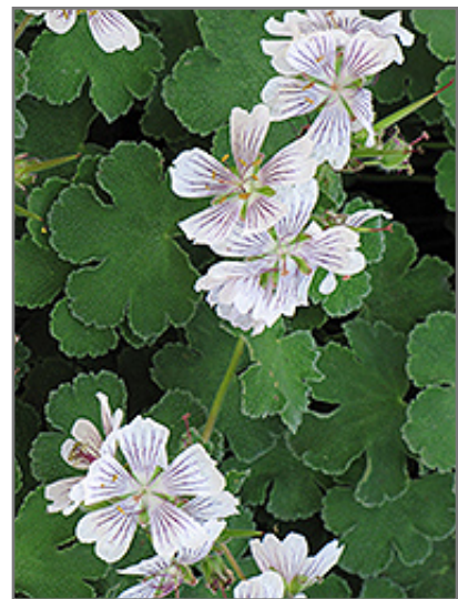
Dwarf Cranesbill flowers