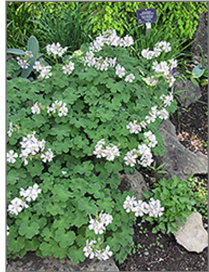
Dwarf Cranesbill in bloom

Dwarf Cranesbill is recommended for the following landscape applications;