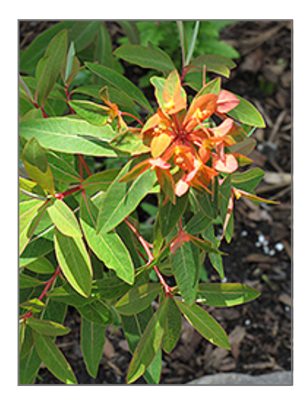
Griffith's Spurge flowers