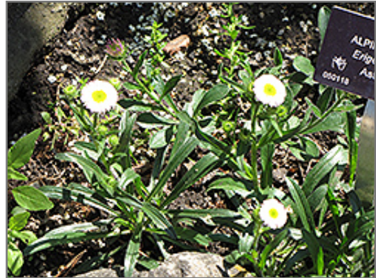
Alpine Fleabane flowers