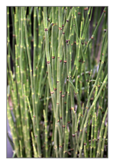
Horsetail foliage