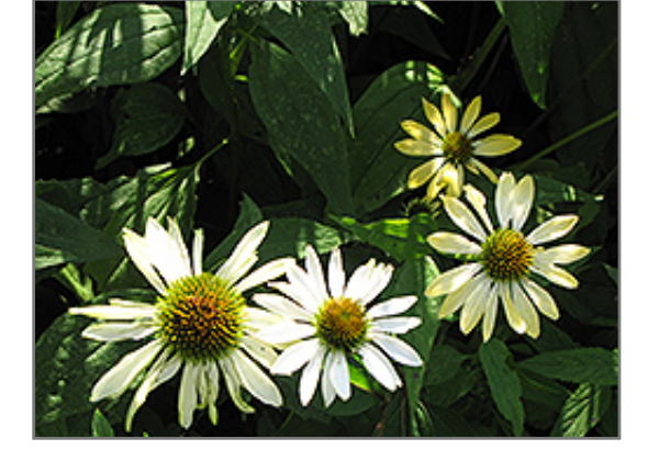
Big Sky Sunset Coneflower flowers

Big Sky Sunset Coneflower has masses of beautiful lightly-scented crimson daisy flowers with dark red eyes and orange tips at the ends of the stems from mid summer to mid fall, which are most effective when planted in groupings. The flowers are excellent for cutting. Its pointy leaves remain green in colour throughout the season.