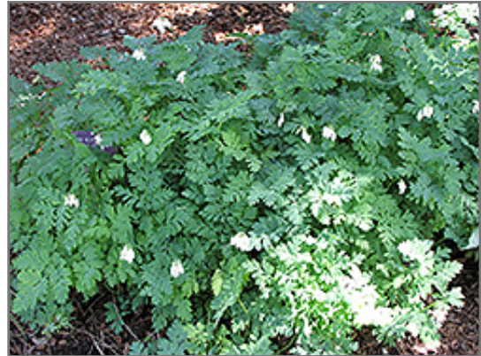
Margery Fish Bleeding Heart in bloom

Margery Fish Bleeding Heart is recommended for the following landscape applications;