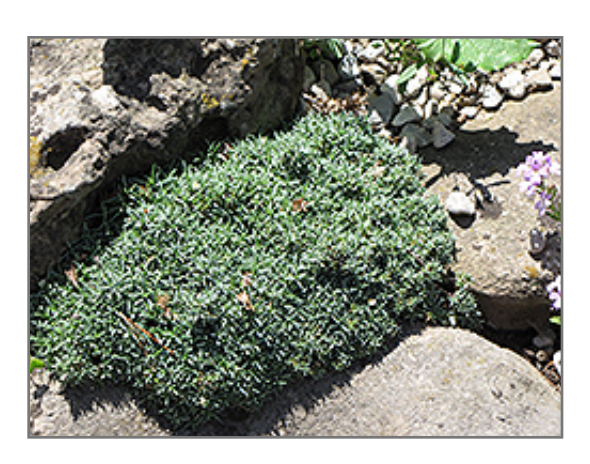
Minimounds Pinks

Other Names: Border Pinks, Cheddar Pinks