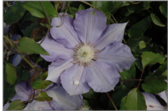
H.F. Young Clematis flowers