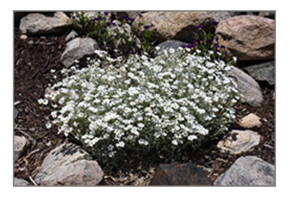
Yo Yo Snow-In-Summer in bloom