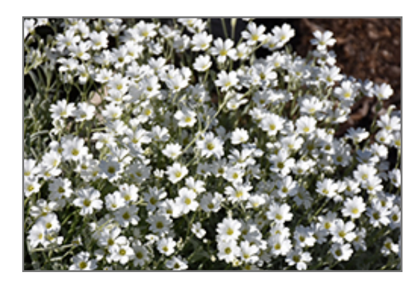
Yo Yo Snow-In-Summer flowers