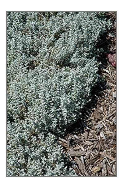
Yo Yo Snow-In-Summer foliage

Yo Yo Snow-In-Summer will grow to be about 8 inches tall at maturity, with a spread of 24 inches. Its foliage tends to remain low and dense right to the ground. It grows at a fast rate, and under ideal conditions can be expected to live for approximately 10 years. As an evegreen perennial, this plant will typically keep its form and foliage year-round.