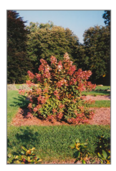
Tardiva Hydrangea in bloom