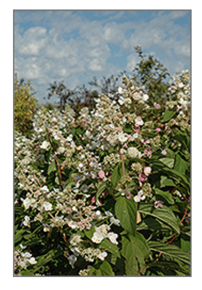
Tardiva Hydrangea flowers

This shrub performs well in both full sun and full shade. It prefers to grow in average to moist conditions, and shouldn't be allowed to dry out. It is not particular as to soil type or pH. It is highly tolerant of urban pollution and will even thrive in inner city environments. Consider applying a thick mulch around the root zone in winter to protect it in exposed locations or colder microclimates. This is a selected variety of a species not originally from North America.