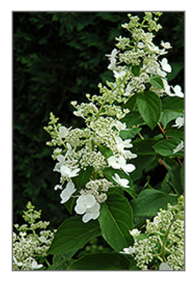
Tardiva Hydrangea flowers