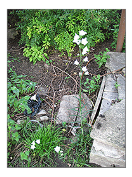
White Gem Bluebells in bloom