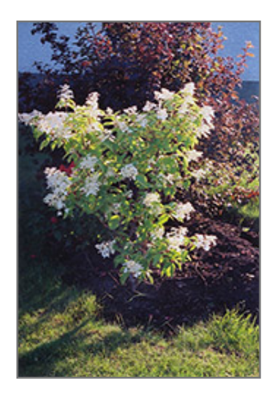
Praecox Hydrangea in bloom