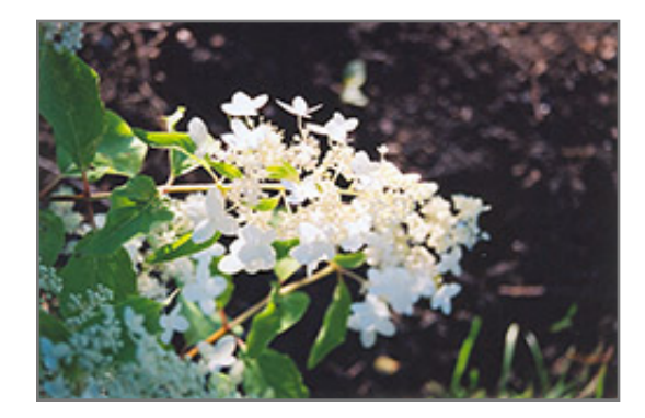
Praecox Hydrangea flowers