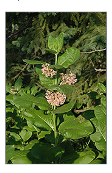
Common Milkweed flowers