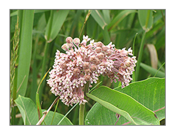
Common Milkweed flowers

This is a relatively low maintenance plant, and is best cleaned up in early spring before it resumes active growth for the season. It is a good choice for attracting butterflies to your yard, but is not particularly attractive to deer who tend to leave it alone in favor of tastier treats. Gardeners should be aware of the following characteristic(s) that may warrant special consideration;