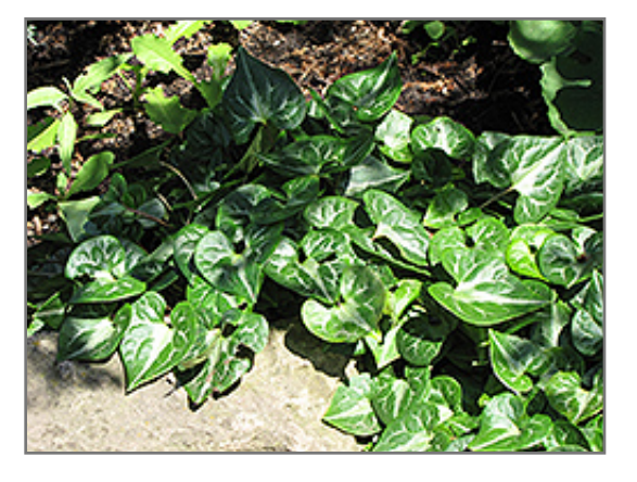
Hartweg's Wild Ginger foliage

Hartweg's Wild Ginger's attractive glossy heart-shaped leaves remain forest green in colour with showy gray variegation throughout the season on a plant with a spreading habit of growth.