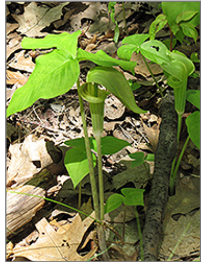
Green Japanese Jack-In-The-Pulpit