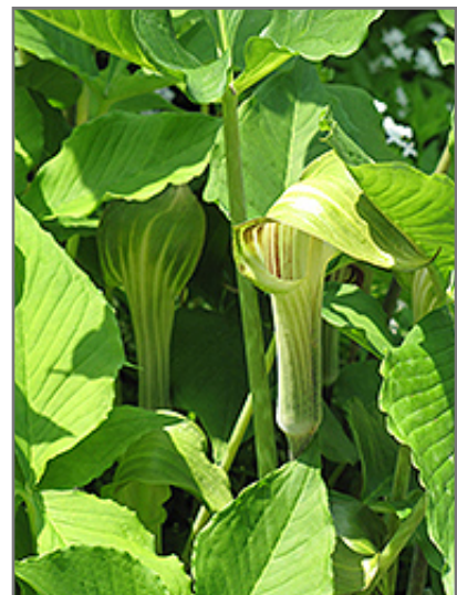
Green Japanese Jack-In-The-Pulpit flowers