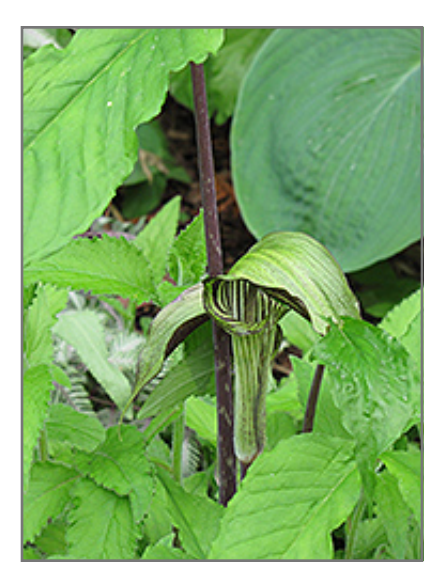
Dark Japanese Jack-In-The-Pulpit flowers

This familiar woodland plant is usually found near water; the flower is actually a deep purple striped green spathe that surrounds and shelters its flower spike; it reaches one to two feet tall by mid spring; a unique accent planting along shaded walkways