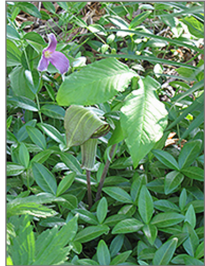
Hybrid Jack-In-The-Pulpit foliage

Hybrid Jack-In-The-Pulpit will grow to be about 8 inches tall at maturity extending to 16 inches tall with the flowers, with a spread of 12 inches. It grows at a slow rate, and under ideal conditions can be expected to live for approximately 5 years. As an herbaceous perennial, this plant will usually die back to the crown each winter, and will regrow from the base each spring. Be careful not to disturb the crown in late winter when it may not be readily seen!