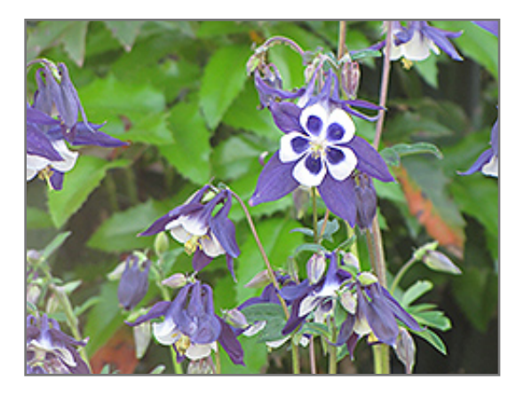
Blue Butterflies Columbine flowers

Blue Butterflies Columbine is recommended for the following landscape applications;