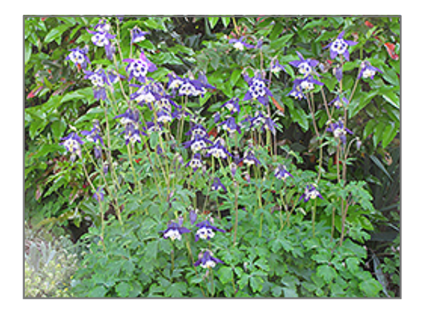
Blue Butterflies Columbine flowers