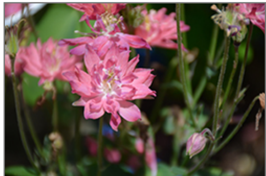
Clematis-Flowered Columbine flowers