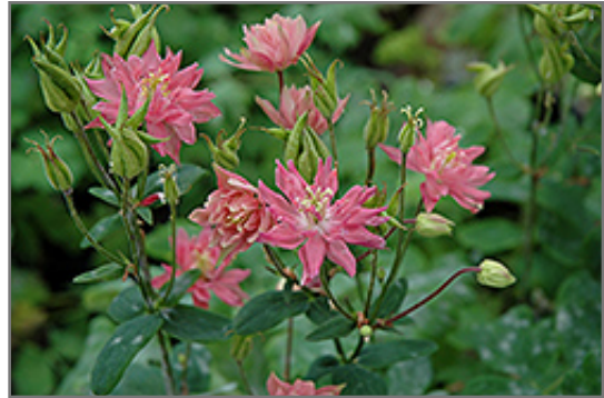
Clematis-Flowered Columbine flowers

Clematis-Flowered Columbine is recommended for the following landscape applications;