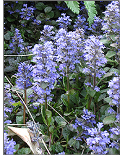
Blue Bugleweed flowers

A striking new true blue Ajuga that has thick dark green glossy foliage and amazing blue flowers; it will light up the floor of a garden like nothing else; vigorous and very cold hardy; excellent for containers, groundcover, and borders