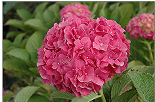
Glowing Embers Hydrangea flowers