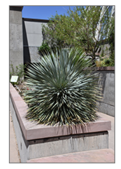
Sapphire Skies Yucca