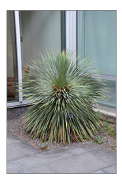
Sapphire Skies Yucca