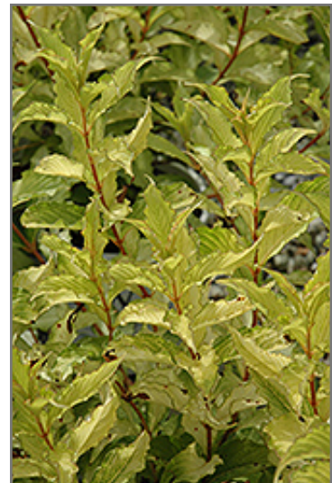
Ghost Weigela foliage