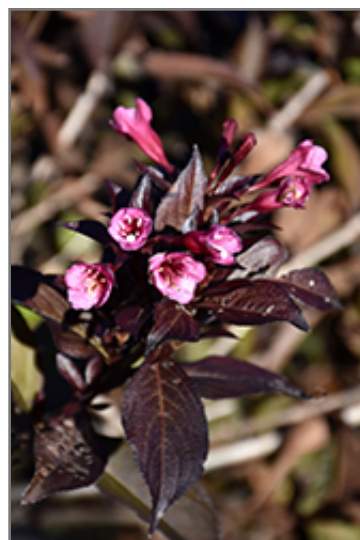
Fine Wine Weigela flowers