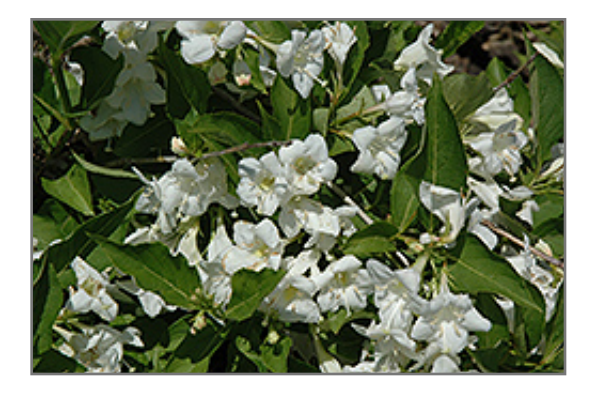
Bristol Snowflake Weigela flowers