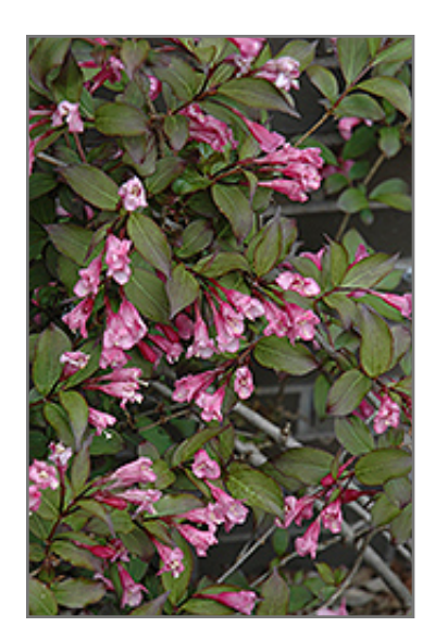
Black Magic Weigela flowers

Black Magic Weigela will grow to be about 18 inches tall at maturity, with a spread of 24 inches. It tends to fill out right to the ground and therefore doesn't necessarily require facer plants in front. It grows at a medium rate, and under ideal conditions can be expected to live for approximately 30 years.