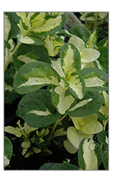
Wojo's Gem Periwinkle foliage