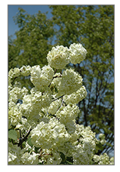
Grandiflorum Doublefile Viburnum flowers

This is a relatively low maintenance shrub, and should only be pruned after flowering to avoid removing any of the current season's flowers. It is a good choice for attracting birds to your yard, but is not particularly attractive to deer who tend to leave it alone in favor of tastier treats. It has no significant negative characteristics.