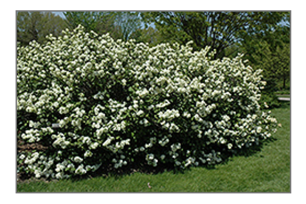
Grandiflorum Doublefile Viburnum in bloom

Grandiflorum Doublefile Viburnum is recommended for the following landscape applications;