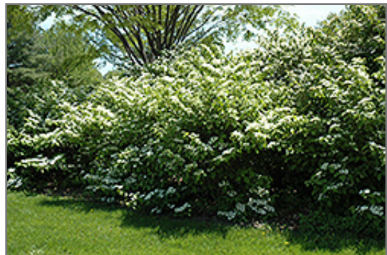
Fireworks Doublefile Viburnum in bloom