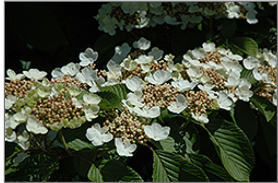
Fireworks Doublefile Viburnum flowers

Fireworks Doublefile Viburnum is recommended for the following landscape applications;