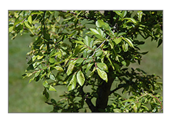
Corkbark Elm foliage

A magificent tall shade or street tree featuring a strongly vase shaped habit and stunning mottled brown bark that is like cork, impressive in winter; highly resistant to Dutch elm disease, adaptable, considered one of the hardiest selections