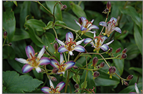
Taipei Silk Toad Lily flowers