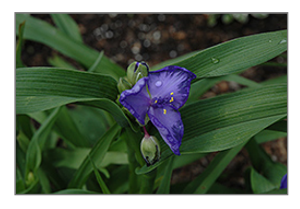
Purple Profusion Spiderwort flowers