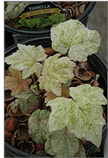
Mystic Mist Foamflower foliage