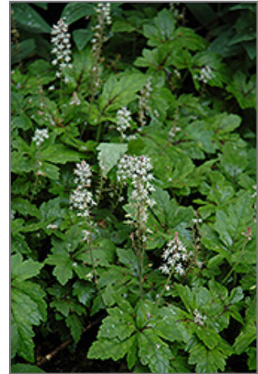
Crow Feather Foamflower flowers

Crow Feather Foamflower is recommended for the following landscape applications;